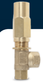
VS 200/180 Pressure relief valve / Valvola di scarico