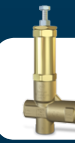
VB 140/160 Unloader valve with by-pass / Valvola di regolazione con by-pass