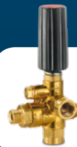
VBXL Unloader valve with by-pass / Valvola depressurizzatrice di regolazione pressione con by-pass