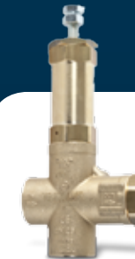
VB 200/150 Unloader valve with by-pass / Valvola depressurizzatrice di regolazione pressione con by-pass