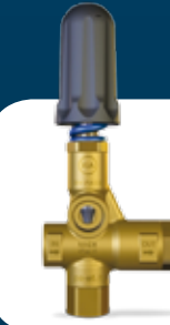
VB 85/280 Unloader valve with by-pass / Valvola depressurizzatrice di regolazione pressione con by-pass